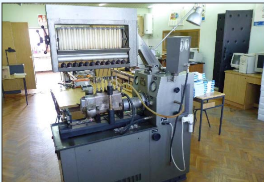
Laboratory for engines and vehicles