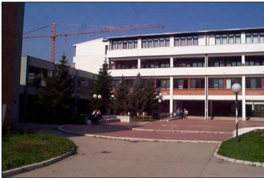
Faculty of mechanical engineering