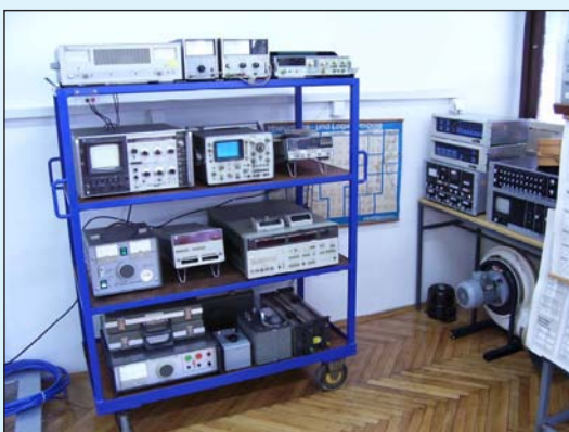
Laboratory for automation and robotics